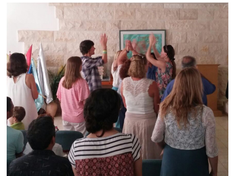
Worship during our Shabbat meeting