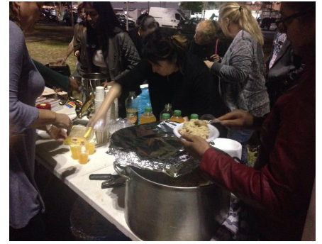
Distributing food & sharing the Gospel during a street outreach in Tel Aviv