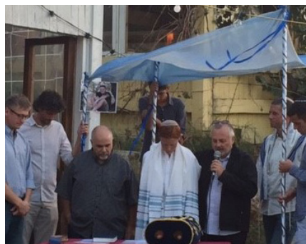
Praying for one of our youth at his Bar Mitsva celebration