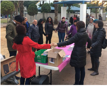
Praying together in the park before starting the outreach