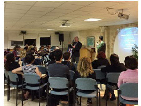
Studying the Word of God and learning how to forgive