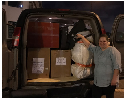
Sending humanitarian aid to the orphans & needy in Ukraine & India