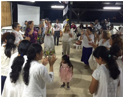
Dancing and praising during the feast of the Lord