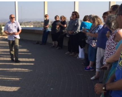
Taglit program - studying about the Land & its people in Samaria