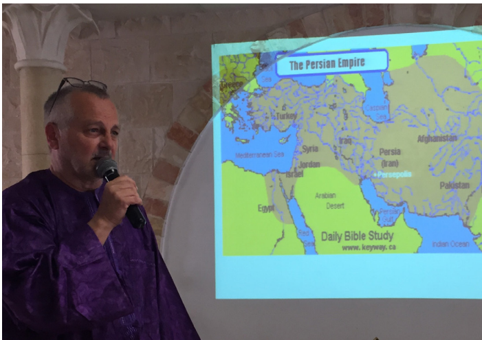
Looking at the Persian Empire, Past, Present and Future

Still today, the presence of foreign powers who are the enemies of Israel is becoming stronger right at our border with Syria. We need you to stand in prayer with us for our protection.