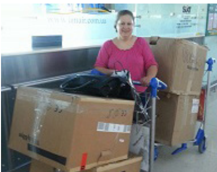
Sending support to the orphans and needy families in the Ukraine