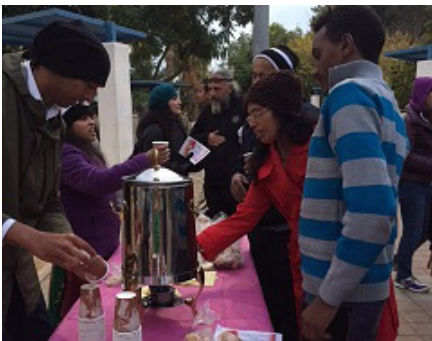
Outreach in Tel-Aviv with our Indian congregation, distributing food and literature in the street