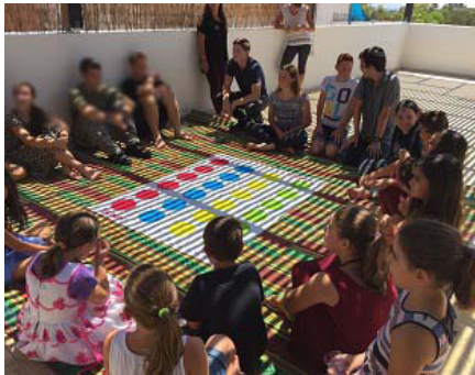
Our children enjoying special summer program on the rooftop of our building