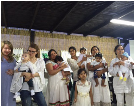
Presenting the first fruits of the womb at the feast of Shavuot

We invite you to join us in celebrating His goodness and faithfulness. Here is a summary in pictures of this past year, reviewing 2016 and all God's blessings.