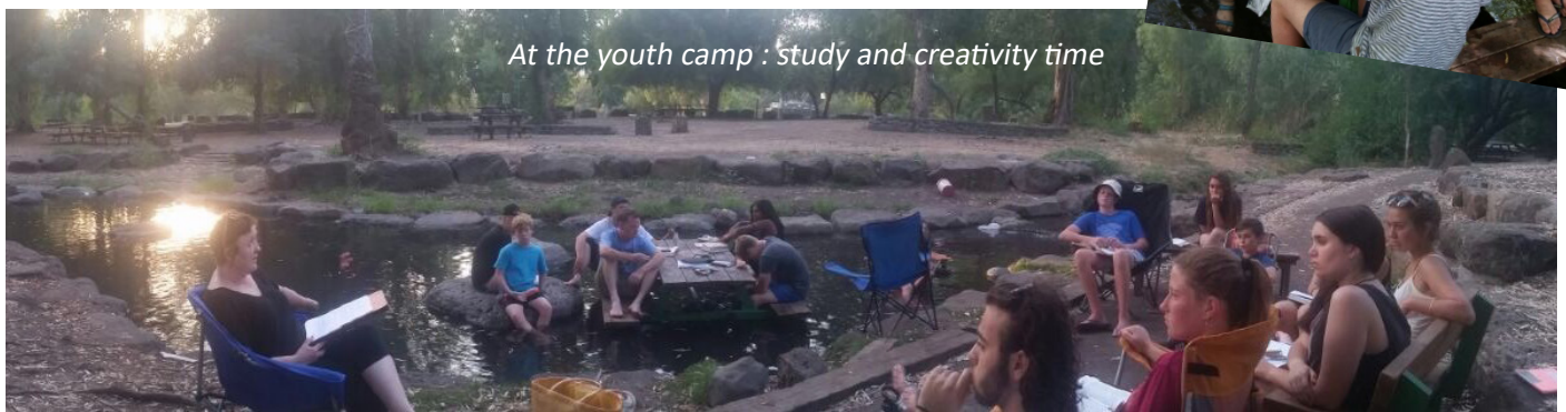
At the youth camp : study and creativity time