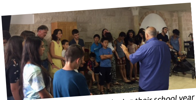
Praying for the children, beginning their school year

If you or your church are interested, contact sallyhamaayan@gmail.com .