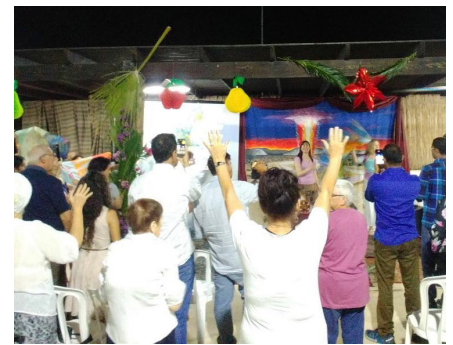
Celebrating Sukkot (the Feast of Tabernacle) on our rooftop