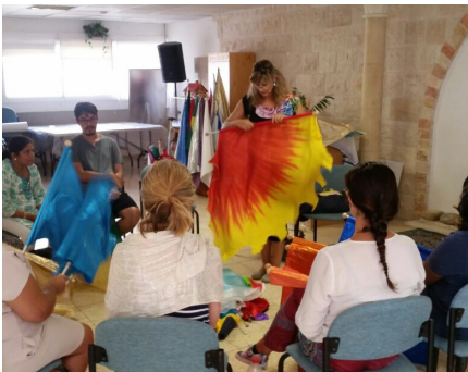
Banner's workshop & learning how to use them in worship & intercession