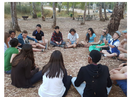
Our youth group Activity in the forest