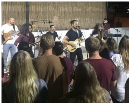
Concert with the Mikedem band on our rooftop