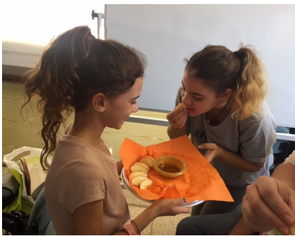
Celebrating the Jewish New Year (Feast of Trumpets) by dipping apple in honey for a sweet year

It is from these wells of salvation, that we share with you the praises of 2017.