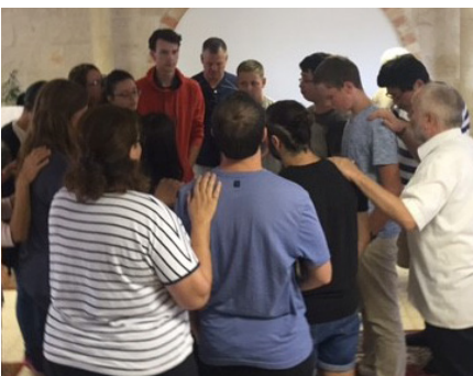
Praying for our next generation