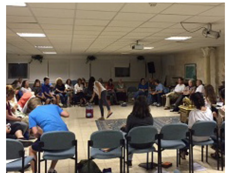
Praying and fasting during Kippur, The Day of Atonement