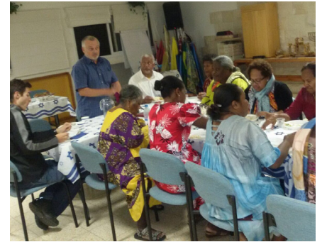
Teaching a group from Pacific Islands - the utmost part of the earth...