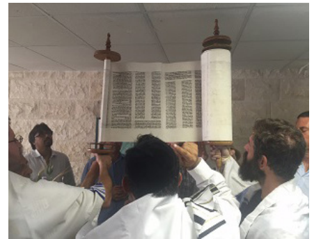
Rejoicing with the Torah during the Feast of Succot