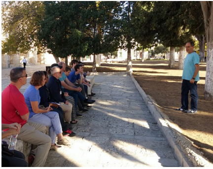
Learning and praying at the Temple Mount, during our Taglit Hamaayan course