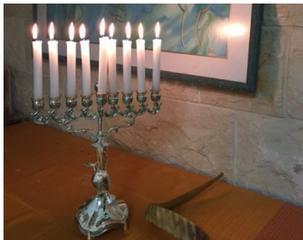
Celebrating Hanukkah and honoring Yeshua, the Light of the World