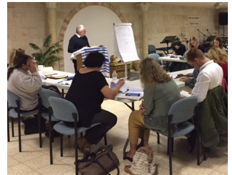
Discipleship Course God has blessed us with numerous new believers who are participating in our new discipleship class