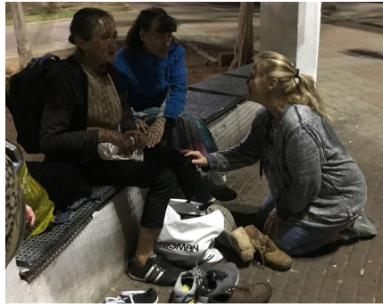
Praying for the homeless during an outreach in Tel Aviv