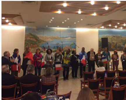
Hosting the annual French speaking conference : discovering and interceding for the Land and its people