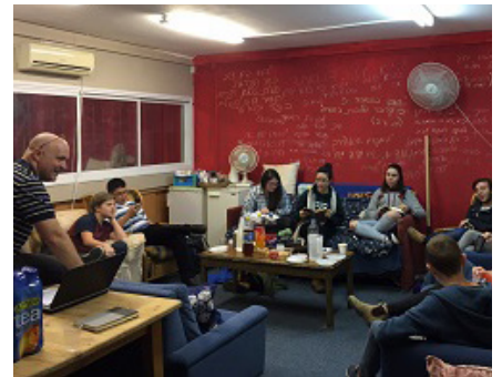
Our Youth group studying the Word of God together