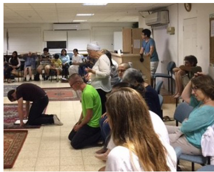
24 hours prayer & fasting during Kippur (Day of Atonement)