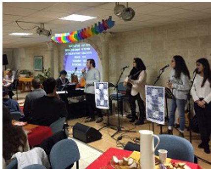
Our youth leading worship during the feast of Hanukkah