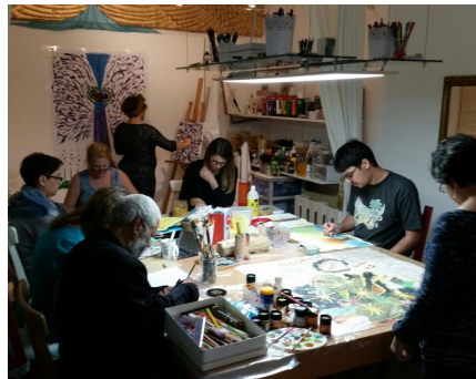
Healing through Creativity. Watching our members & community touched by God through art & creativity