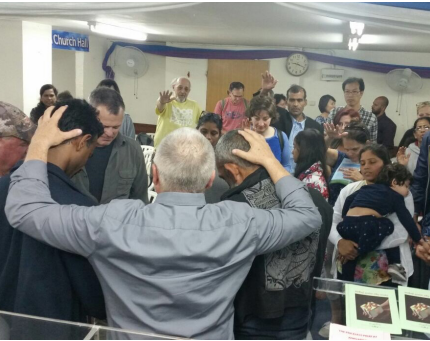
Leading new people to the Lord after street outreach