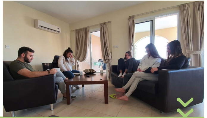
Special 4-day retreat for our young people, preparing them to enter their army service. Important biblical principles were shared, in order to enable them to sustain their faith during their army service.