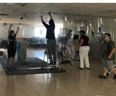
Dividing our meeting room, so that more people can join the meetings

At the moment, we are still limited to 10 people indoors and 20 outdoors . With our meeting room having 2 entrance doors, we split the room into 2 by "building" a plastic partition in the middle. In this way we can accommodate 20 people each Shabbat meeting, while we continue to utilize Zoom for the others. People are so thirsty to worship and fellowship face to face , after being on zoom for so long, that they register weeks ahead of time! Since we have multiple floors in our building, we can gather in different rooms, have more people join and still keep the regulations. We started the children's program for the little ones again and hope to make it for the older children which is a greater challenge. We thank God for our roof top, where we can fellowship and eat together in the open air, after the Shabbat meetings and other occasions.