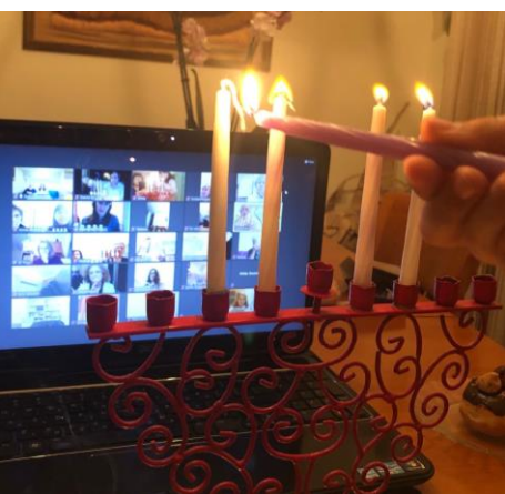
Lightening the Hanukkah candles together

We have been busy building "new wine skins" for the new wine harvest the Lord has opened for us. We were blessed to see new people, Israelis of all ages, coming to faith in Yeshua. They are discovering their gifts and volunteering service. We are seeing the awakening of the Spirit in our midst . A real thirst for the Word of God and the Kingdom values is apparent among so many. We meet on Zoom almost daily for prayer and bible studies as well as small support groups. Currently, we are teaching the Gospel of John and the book of Revelation each week.