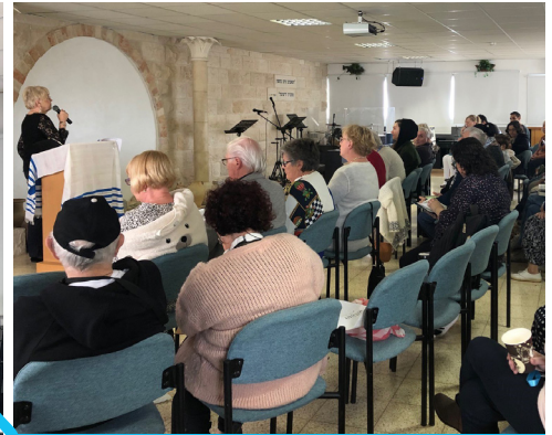
Our congregation was blessed by international teachers speaking & ministering with the focus on prayer and healing of the body, soul and spirit. Many lives were deeply touched, bringing healing and freedom!