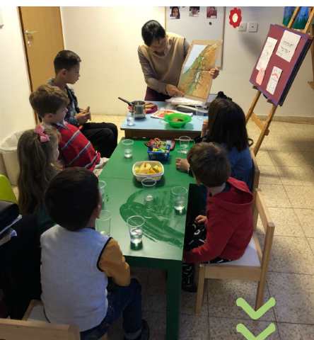
One of the classes during our Shabbat meeting. We are thankful for each precious child who participates. They hear the word of God and seeds are planted for eternity.