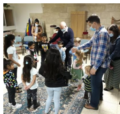
Back to (face to face) children ministry