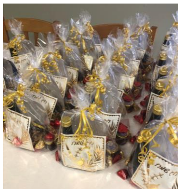
Gift bags for both the children and our elderly