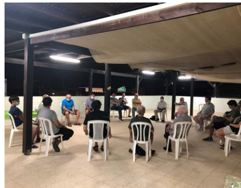
Our men meeting together on the rooftop of our building for a time of prayer & encouragement