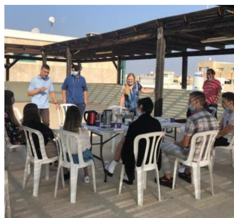
Sharing testimonies with young new believers

At the moment, we are still limited to 10 people indoors and 20 outdoors . With our meeting room having 2 entrance doors, we split the room into 2 by "building" a plastic partition in the middle. In this way we can accommodate 20 people each Shabbat meeting, while we continue to utilize Zoom for the others. People are so thirsty to worship and fellowship face to face , after being on zoom for so long, that they register weeks ahead of time! Since we have multiple floors in our building, we can gather in different rooms, have more people join and still keep the regulations. We started the children's program for the little ones again and hope to make it for the older children which is a greater challenge. We thank God for our roof top, where we can fellowship and eat together in the open air, after the Shabbat meetings and other occasions.