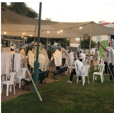
Yom Kippur prayers at one of our local Synagogues