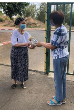
Distribution of special encouraging gifts to our elderly

Despite these challenges, God has not forgotten His people. We have used this unusual time to creatively remind and encourage our members and friends that our God is still on the Throne. Through zoom, our congregation met to pray for Israel, her government, and the salvation of her people, including our family and friends. Gifts were distributed to the younger generation who had to adjust to the new school schedule and guidelines, and to the older generation who are confined to the elderly homes, or cannot leave their own apartments.