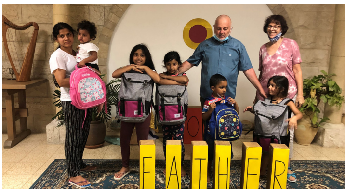
We could bless some of the needy families with schoolbags filled with supplies, donated to us by a Dutch organization. The children & their parents were so grateful!