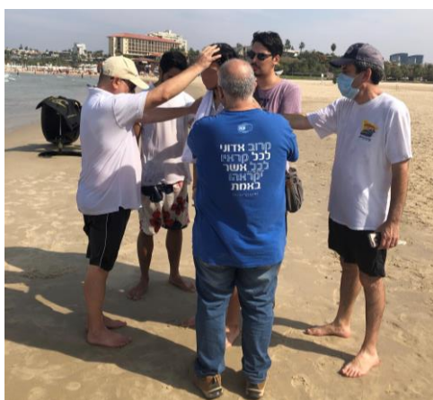
Praying during immersion by the Mediterranean Sea