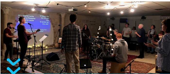
Our worship team leading us in an especially inspiring night of praise & worship, giving God glory from our hearts.