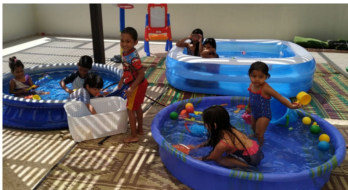
Our kids loved "summer camp" on the roof with wading pools. After swimming, they had a comprehensive program learning about the Father, Son and Holy Spirit.