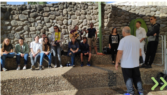
We have seen much spiritual growth in our members, both Israelis and new immigrants. Here, some young people are preparing their hearts in worship before their immersion in water.