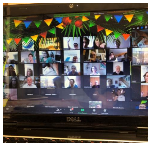
Zoom meeting inside our « Succah » during the Feast of Tabernacles

Despite these challenges, God has not forgotten His people. We have used this unusual time to creatively remind and encourage our members and friends that our God is still on the Throne. Through zoom, our congregation met to pray for Israel, her government, and the salvation of her people, including our family and friends. Gifts were distributed to the younger generation who had to adjust to the new school schedule and guidelines, and to the older generation who are confined to the elderly homes, or cannot leave their own apartments.