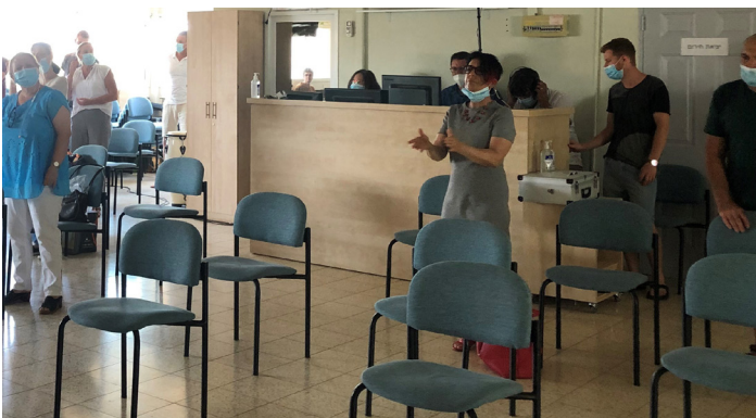
Our first return back to the meeting hall after months on Zoom. Sadly, after this meeting, the government changed the restrictions from 50 to only 10 people allowed to attend meetings.

In two short months, just under 1 million people suddenly found themselves jobless, which is over 20% of the work force. Every night thousands of people are on the streets of Tel Aviv & Jerusalem, demonstrating against the government economic decisions. Many are confused and have lost trust in politicians.