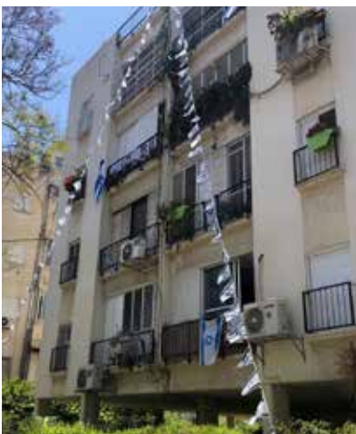
Empty streets with decorated buildings on Independence Day.