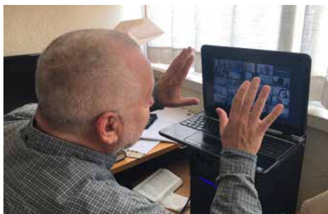
Praying the Aaronic Blessing at the end of our Shabbat service

Flowers were sent on Holocaust Memorial Day to those that suffered the trauma of the Holocaust. Our hearts were heavy because we could not hug them in their pain and loneliness. What we can do and have done during this time is pray for the Comforter who knows and cares to come and fill the holes in our hearts, He who binds up our wounded souls. Yeshua is His name, and this is His country. We are so honored to be used, not only for our members, but also for our non-believing neighbors and friends.