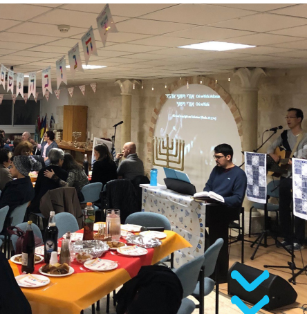
Celebrating Hanukkah together (John 10:22), we remembered Yeshua, the Light of the world as well as the mandate He gave us, to be a light to the world. We heard powerful testimonies of changed & restored lives of some of our members, and how God brought each of them from darkness to light.