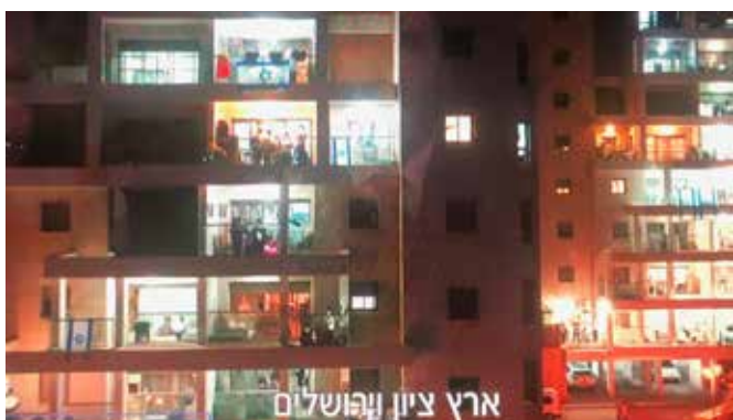
The people of Israel singing the national hymn on the balconies on Independence Day.