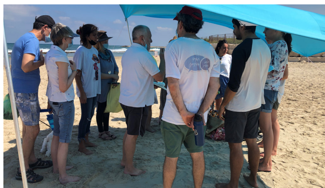
During the Covid pandemic, we have seen a number of decisions to follow or draw closer to Yeshua. Here we are preparing for a water immersion celebration on the beach of the Mediterranean.