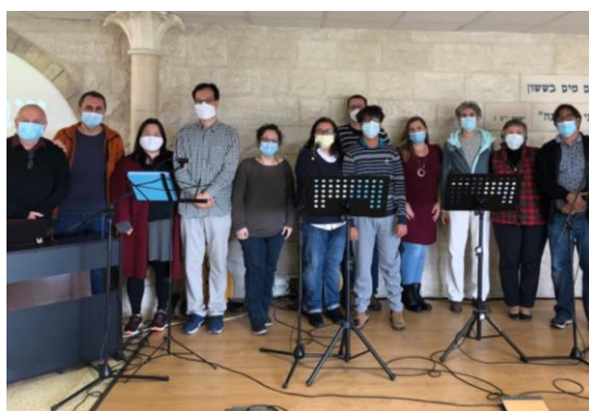
Our worship team is back to minister to the Lord & serve people.