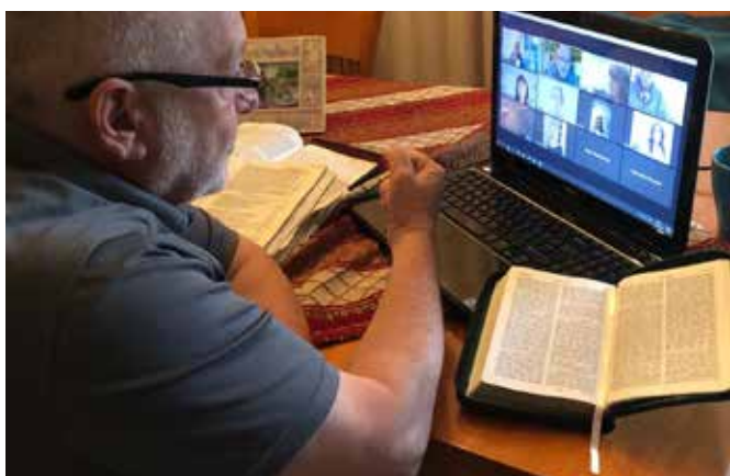
Teaching discipleship/bible study-Corona style

We managed to adjust our congregation as well as our personal lives. In what seemed a crash course in learning and using zoom, our meetings, homegroups, bible studies and prayer meetings are now via the internet. More than 70 homes are connected via zoom on our Shabbat morning gathering. We praise God for some «lost sheep» who returned and are joining us now due to this crisis. The hardest part of this season was the lack of human contact. We tried to overcome that by shopping for our elderly and those in quarantine.