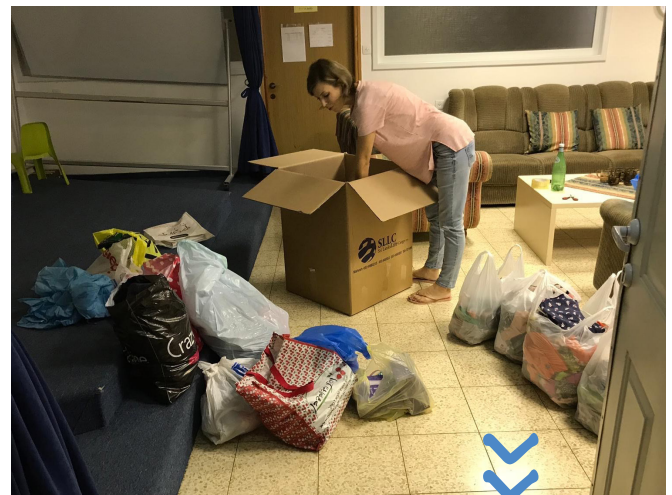
Our ongoing ministry of preparing parcels of necessities that we distribute to the needy families.