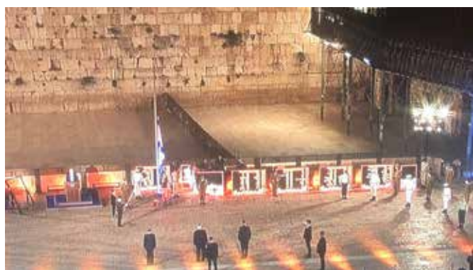
Ceremony at the empty Wailing Wall in Jerusalem on Memorial Day.

We managed to adjust our congregation as well as our personal lives. In what seemed a crash course in learning and using zoom, our meetings, homegroups, bible studies and prayer meetings are now via the internet. More than 70 homes are connected via zoom on our Shabbat morning gathering. We praise God for some «lost sheep» who returned and are joining us now due to this crisis. The hardest part of this season was the lack of human contact. We tried to overcome that by shopping for our elderly and those in quarantine.