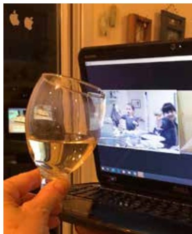
Our family Pesach Seder (evening of Passover)

In Israel, February though May are the months of our spring holidays: Purim, Passover, Holocaust Remembrance Day, Memorial Day for soldiers & victims of terror attacks, Israel Independence Day and finally, the feast of Shavuot (Pentecost).