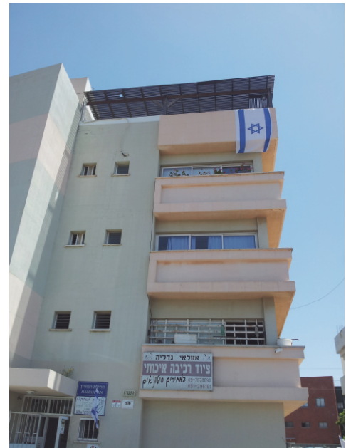
Hamaayan Congregation Building