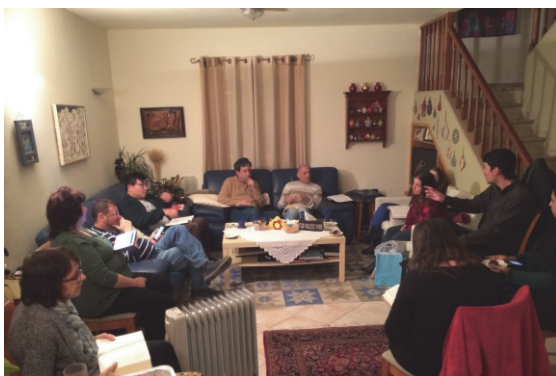
Studying the Word of God in One of Our Home Groups