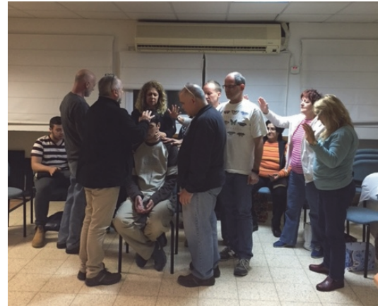
Praying for Healing During our Meeting

We are soon going to celebrate the feast of Purim, reading the book of Esther and rejoicing in God's salvation of Israel from her enemies. This is the story of Queen Esther who was raised up by God to save Israel from total destruction. It reminds us again of the challenge that we too were born for such a time as this, as ambassadors of His kingdom on earth.