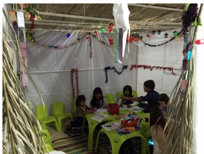
Our children learning their Shabbat lesson in the Sukkah