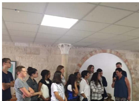
Praying for one of our youth as she enters into military service

With your prayers and support, we can be the watchmen and shepherds of the lost sheep of Israel. Thank you for walking with us in His grace.