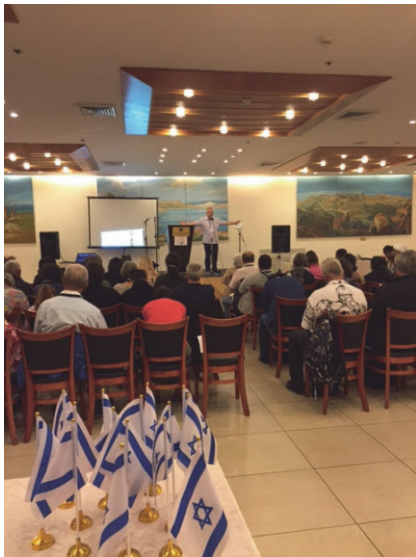
French Speaking Conference

The Circle of Life is celebrated in every stage...whether its the birth and dedication of a child, one studying the word of God, or entering the army, we ask God's guidance on all.