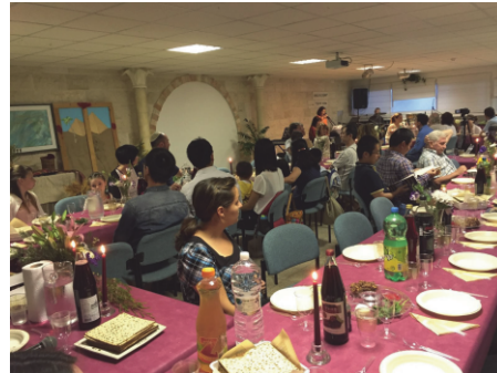
Celebrating Passover evening Seder in our congregation