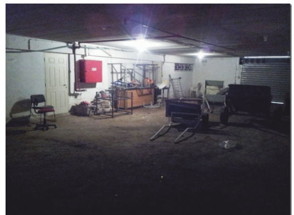
Our Bomb Shelter/Youth Center in the basement floor

This year, through you, we focused on raising support for our bomb shelter/youth center. Through you, we have raised the necessary funds to purchase this. While we were patiently waiting for the "red tape" to be cleared by the municipality, we discovered that God protected us once again. During this process, our lawyer discovered a loophole in the contract. If we had signed it any sooner than now, it would have cost us a great deal. But the timing is perfect and we are so grateful for your prayers on our behalf. Please continue to pray for the Lord's wisdom and direction for the right date to sign.