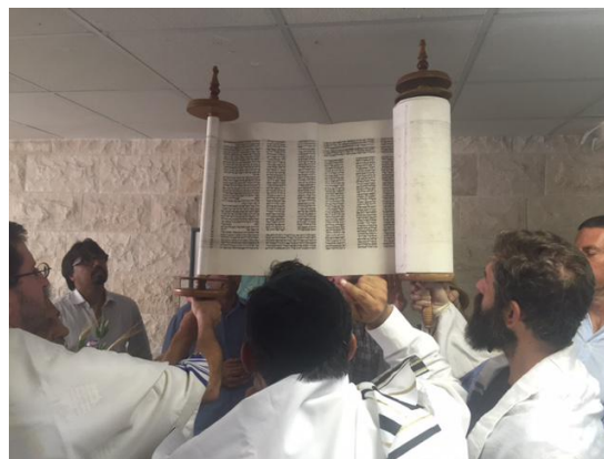
Honoring and thanking God for giving us His Word

On the last day of the Feast of the Ingathering, when all the nations are commanded to come worship the Lord together as one, “If anyone thirsts, let him come to me and drink. Whoever believes in me, as the Scripture has said, ‘Out of his heart will flow rivers of living water.’” (John 7:37-38.) His comment references the tradition that this day is also a celebration of the water and wine poured over the sacrifices on the altar. This is one of the most joyous days of the year for the Jewish people. We all came together to celebrate His blessings and goodness. With over twenty nations represented, new families, and many guests, we remembered that Yeshua is our living water that gives us life abundantly.