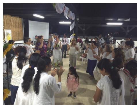
Celebrating the Feasts in Dancing