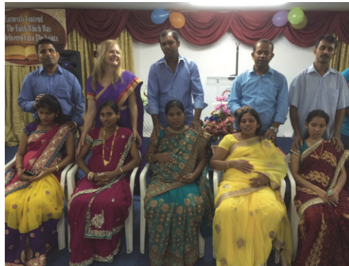
Praying for our Pregnant Mothers at our Indian/Lankans Congregation